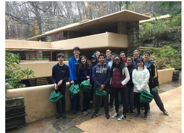
PHS students visit Fallingwater, a Frank Lloyd Wright home in Mill Run, PA.

Project Lead The Way is a national program and is the nation's leading provider of K-12 STEM programs.