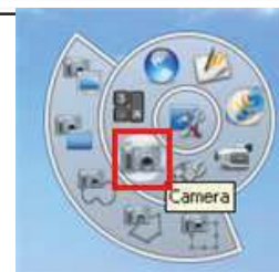
Camera using Desktop Tools

Point to Point Snapshot – Click and drag, drawing straight lines to enclose a highlighted outline area on the grayed-out screen. The area cannot be moved or modified. If you need to change it, just close the Camera Snapshot box and try again.