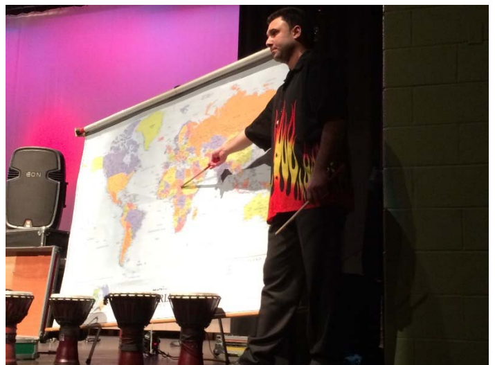
Demonstrating the percussion world