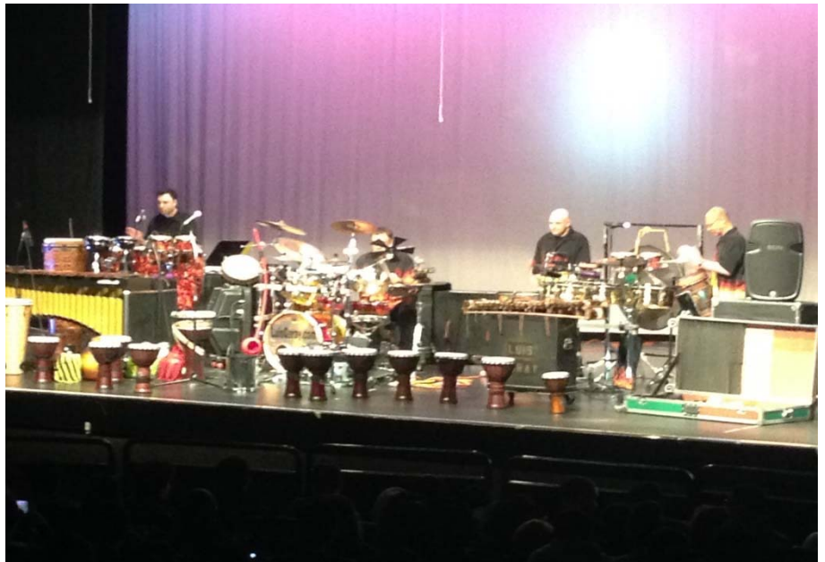
Hispanic Music and Latin Percussion from the Washington Performing Arts

"Each person must live their life as a model for others."