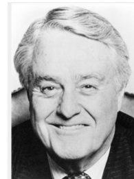
Sargent Shriver 1915 - 2011