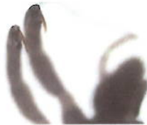
Adult louse claw