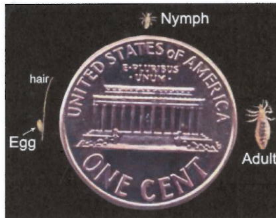
Actual size of the three lice forms compared to a penny.

There are three forms of lice: the egg (also called a nit), the nymph, and the adult.