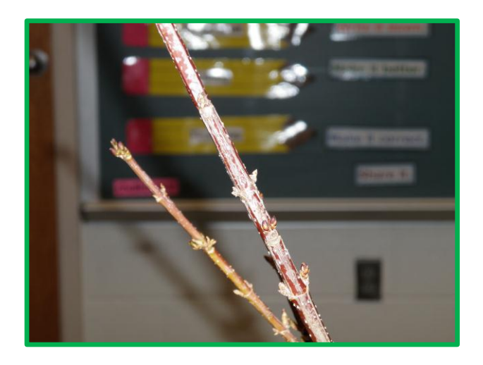
March 1, 2011