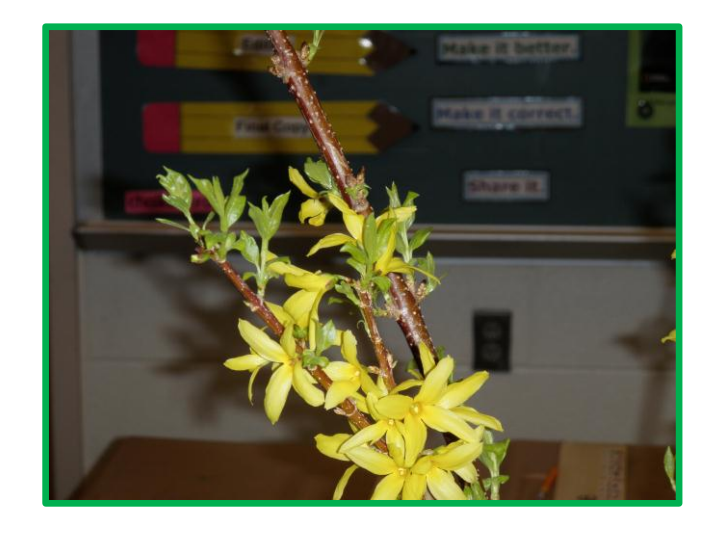
March 10, 2011