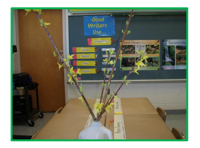
March 8, 2011