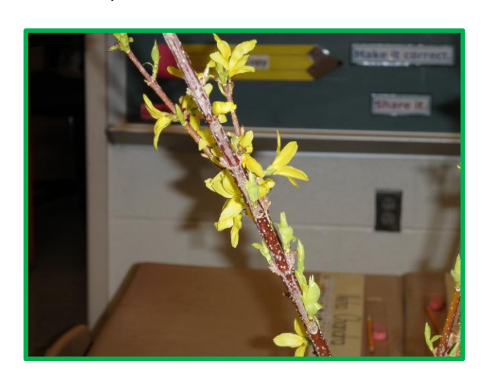
March 8, 2011