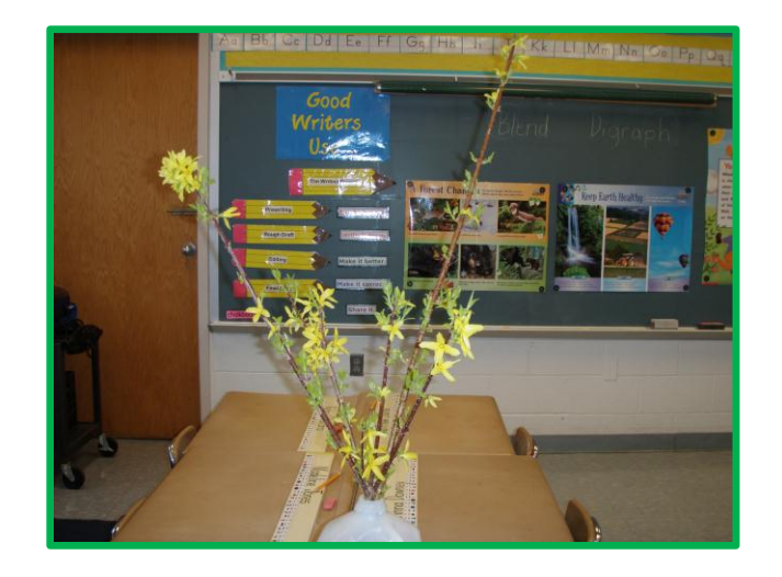
March 10, 2011