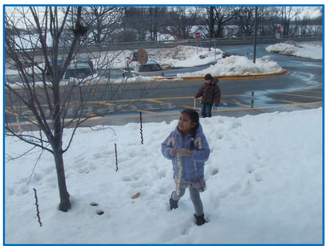
Repurposing cranberries that had been used as decorations and stale popcorn