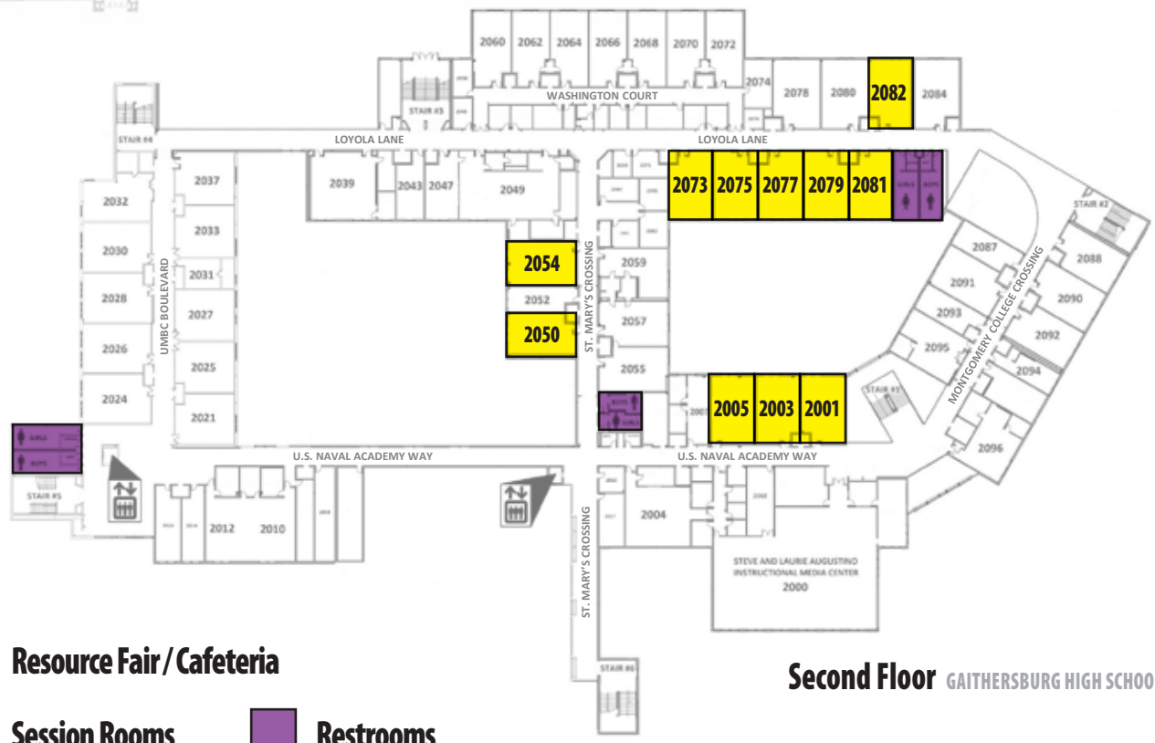
Second Floor GAITHERSBURG HIGH SCHOOL