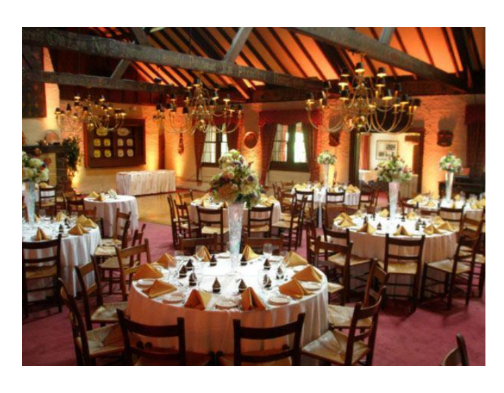
Normandie Farm Restaurant

Business meeting/luncheons are held four times a year at the delightful Normandie Farm Restaurant, 10710 Falls Road, Potomac, MD 20854.