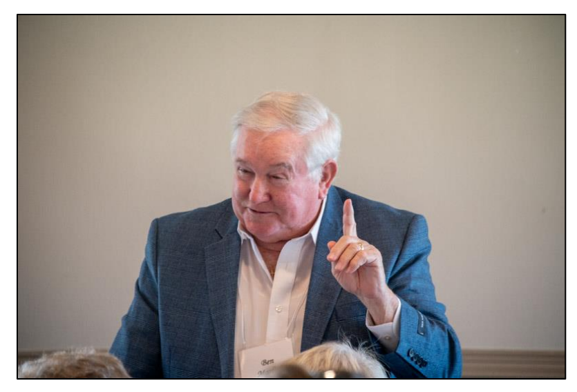
Check the MCPSRA website for latest information: http://www.mcpsra.org