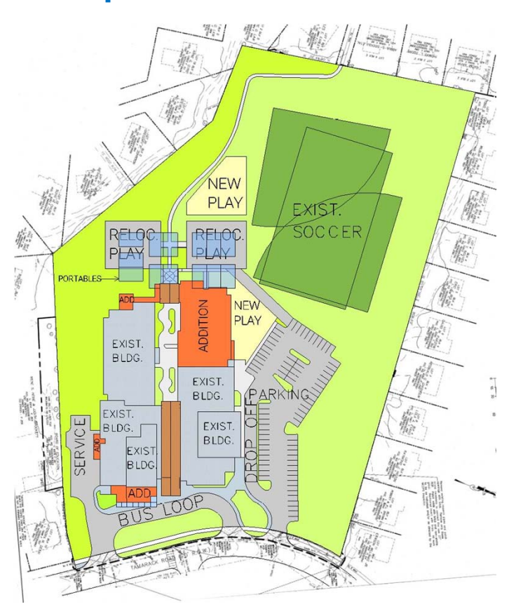
Option 2 Site Plan