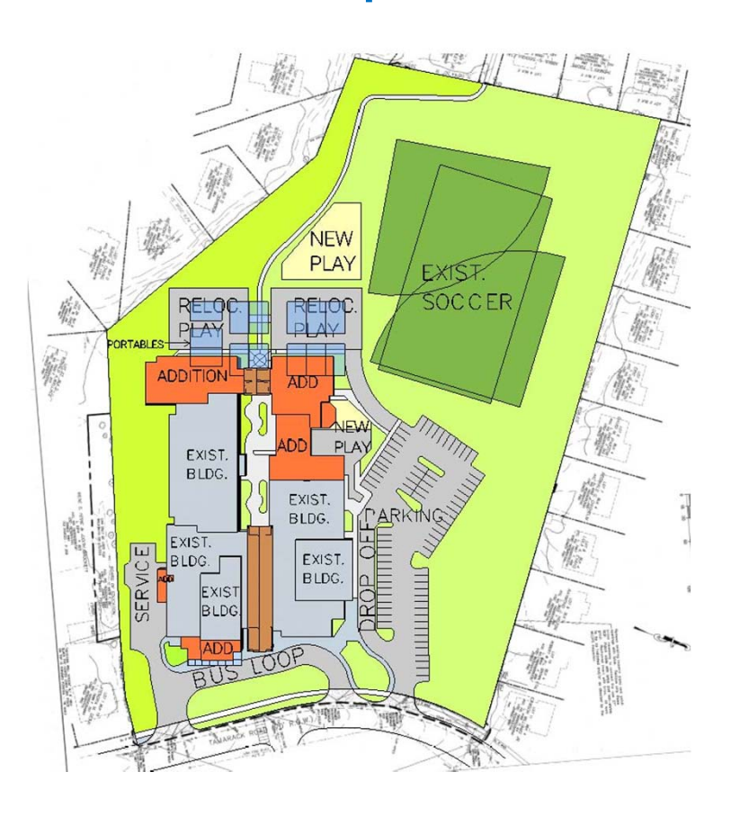
Option 1 Site Plan