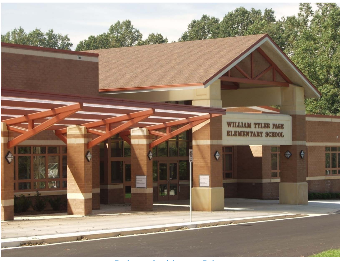
Delmar Architects, P.A.