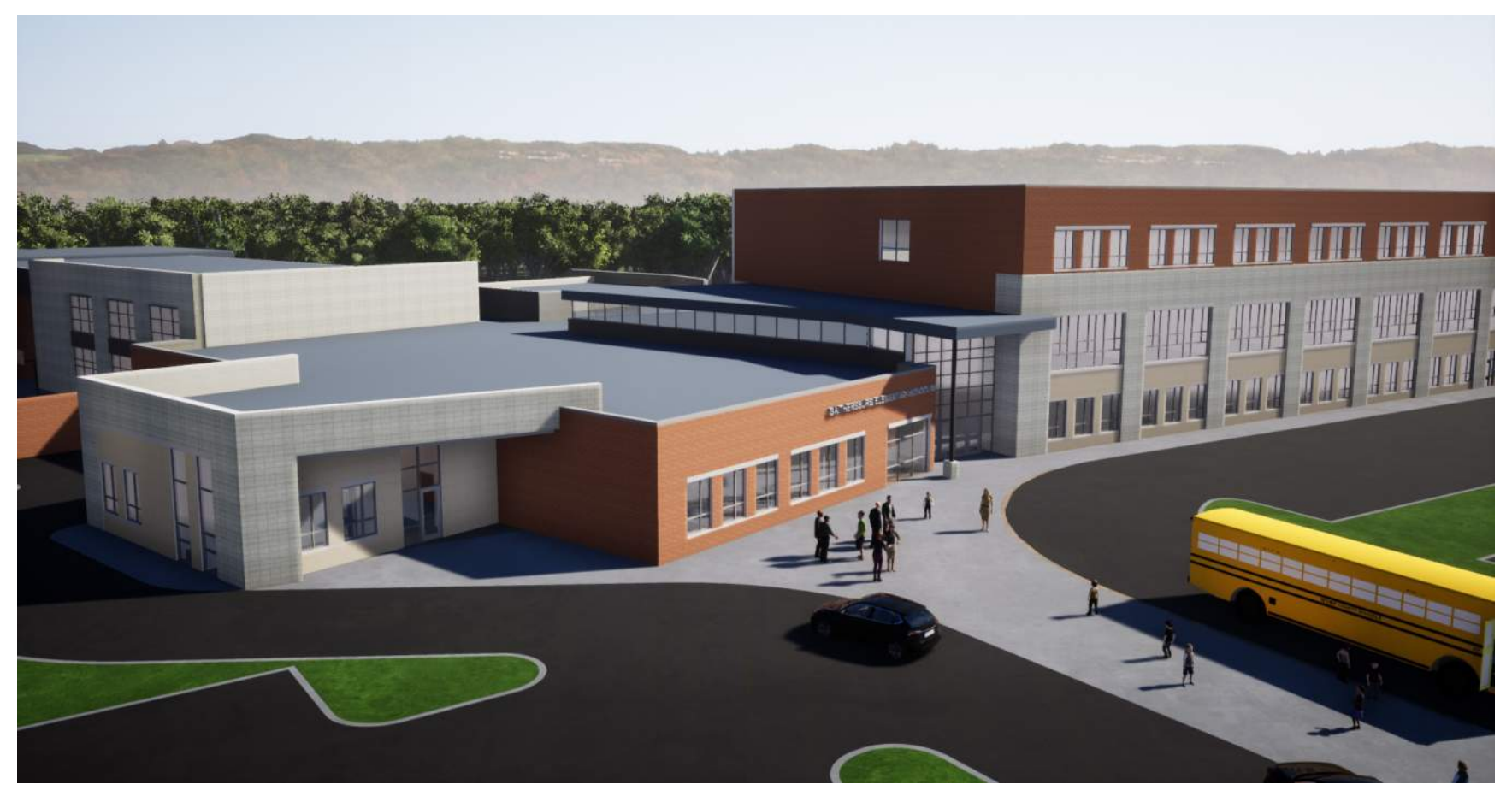
View from Student Drop-off Loop